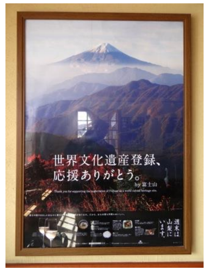
One of the four posters produced and widely distributed and displayed thanking the community for its support.

The proximity of the Highlands theme park so close to the Kawaguchiko Visitor Centre is a bit off-putting. This Dreamworld clone rises high above the landscape but if the riders of the roller coaster can think above the white knuckles and screams they would have a magnificent view of Mount Fuji if it isn't clouded in as it was for most of the day we were there. Fortunately we did experience some breaks in the clouds to capture some photos.