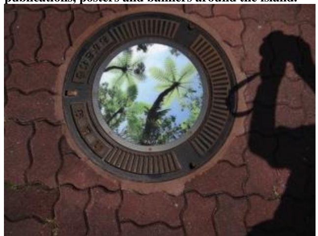
Footpath inlays & access hole covers describe OUV

This logo was developed by the Chamber of Commerce and Tourism and featured widely on badges, publications, posters and banners around the island.