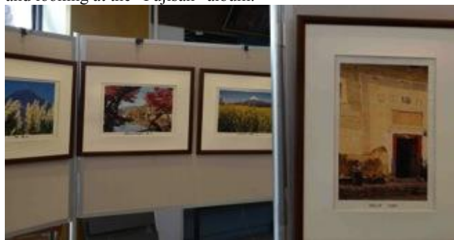
The emphasis on Fujisan's aesthetic values was impressive