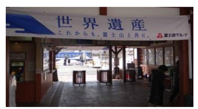
Even the Railway Station carried a banner of support